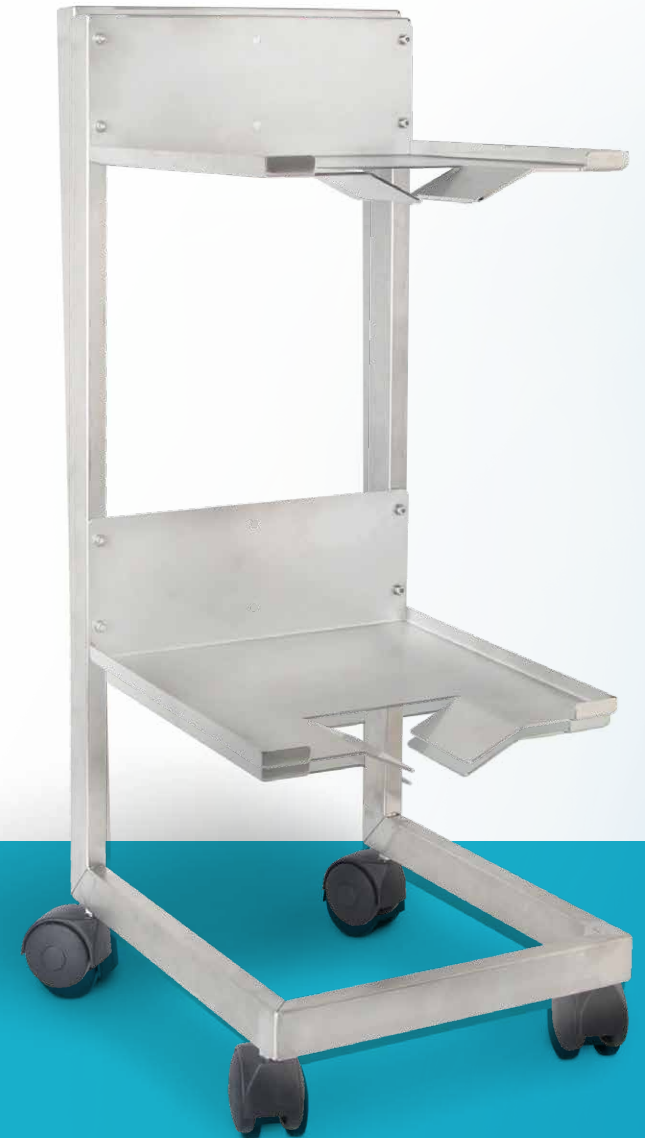
FLOOR MOUNT MODULE 2